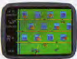
THE SECRET DOOR