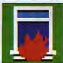
LARGE WINDOW FIRE