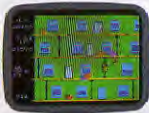
THE PIPE MAN EUVER