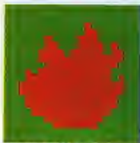
RED FIRE PARTICLE