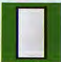
THE SECRET DOOR